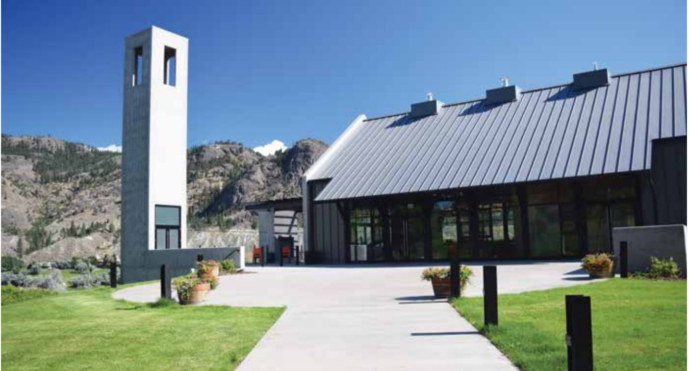
Welcome to Monte Creek Ranch Winery.

Perched on the edge of a bank that slopes down toward the highway and the river, Murray says they wanted it built as far out on the bank as possible to be visible to the highway and to take advantage of the view.