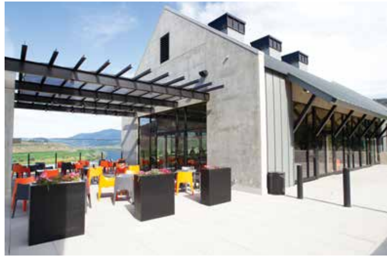
The winery building has a production facility on the ground floor, and a wine shop, tasting room, and picnic area on the second level, and overlooks the Thompson River.

In the beginning of December, the winery held its first Christmas open house where more than 1,000 people dropped by over the course of the afternoon.