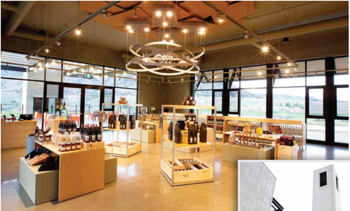
The wine shop interior featuring 'lasso and spurs' chandelier.

There's a new sheriff in town. High up on a hill overlooking the Thompson River and visible from Highway 1, a working ranch and winery is the newest addition to the Kamloops wine scene.